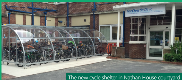
The new cycle shelter in Nathan House courtyard

The Christie supports all staff in having a healthy lifestyle and the growth in facilities for cycling to work is an example of this in action.