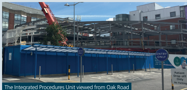
The Integrated Procedures Unit viewed from Oak Road

Please come along and have a look, it provides a much improved view for our patients and visitors.