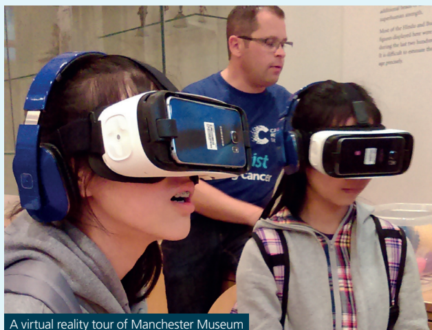
A virtual reality tour of Manchester Museum

The festival was a great opportunity to showcase Manchester's research excellence and MCRC was delighted to be involved.