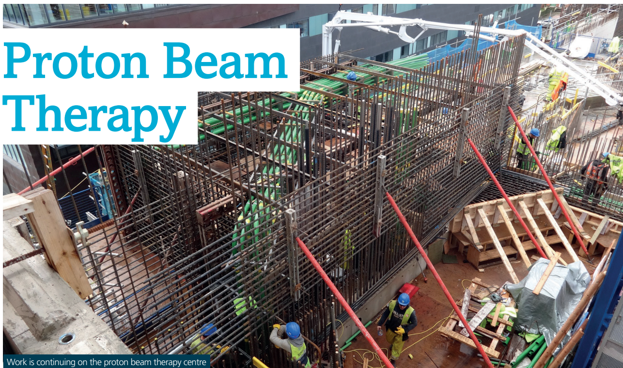
Work is continuing on the proton beam therapy centre