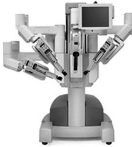
Fig 1b Robot with specialised arms

The da Vinci surgical system is a sophisticated robotic platform (see above). It consists of a surgeon's console (see Fig 1a) where the surgeon sits and carries out the operation. The specialised instruments are passed through keyhole openings in the tummy which are then connected to the specialised arms of the robot (see Fig 1b). The surgeon manipulates the instruments within the tummy with precision by moving the master controls at the console.