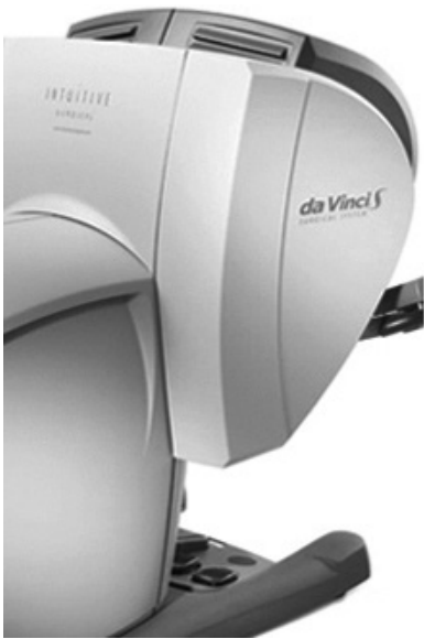
Fig 1a The surgeon's console